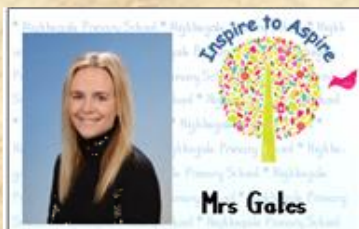
Early Years Leader Woodpecker Teacher (Mon-Wed)