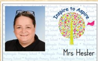
Woodpecker Learning Coach (HTLA)