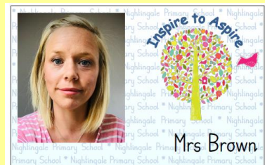
Woodpecker Class Teacher (Wed-Fri)