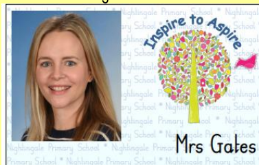
Woodpecker Class Teacher (Mon-Wed)