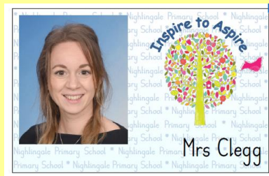
Early Years Leader