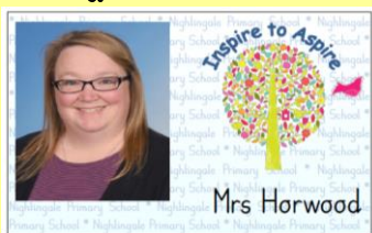
Kingfisher LSA and EYFS Speech and Language