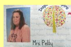
Kingfisher Learning Coach