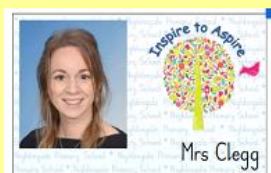
Early Years Lead