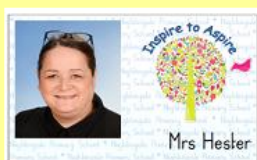
Woodpecker Learning Coach (HTLA)