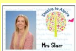
Woodpecker Learning Coach