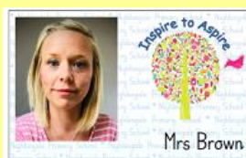
Woodpecker Teacher (Wednesday – Friday)