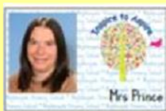
Kingfisher Learning Coach