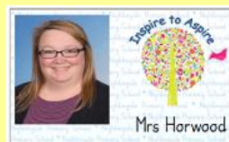
Kingfisher Learning Coach EYFS Speech & Language