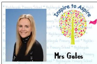
Woodpecker Teacher Mon-Weds