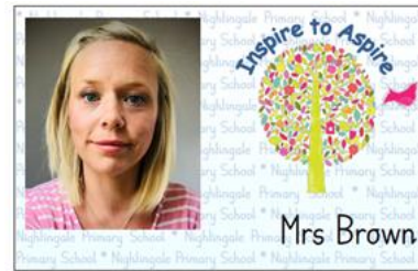
Woodpecker Teacher Weds-Fri