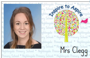
Early Years Leader

Children will continue to attend forest sessions on Friday afternoons. Please keep an eye on class dojo for when it is your child's turn.